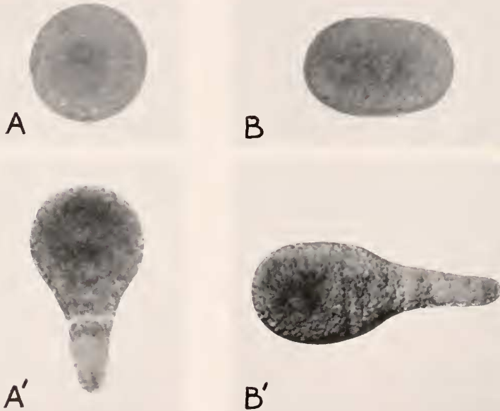
FIG. 1. Photomicrographs of Fucus eggs as seen from above. (A) Normal spherical egg soon after fertilization; (A') similar egg after rhizoid has formed. (B) An egg which has been elongated soon after fertilization; (B') an elongated egg which has developed in normal sea water at pH 8.0, showing typical formation of rhizoid at one end of long axis.

Only spherical eggs were selected so that they were taken into the pipette entirely at random with respect to any pre-existing organization which might occur in the egg. The eggs were taken into the pipette at 10–20 minutes after fertilization. Each egg was gently blown out into an individual 1 cc. syracuse dish containing either of two media: normal sea water at pH 7.8–8.2, or sea water acidified to pH 6.0 by adding 5 parts of McIlvaine's buffer (secondary sodium phosphate-citric acid) to 95 parts of sea water. The acidified sea water was equilibrated with